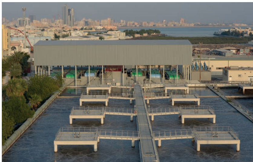
The compact SMART™ units are in the background.

The HYBACS® Upgrade at Tubli WPCC has more than doubled the capacity of existing aeration lanes.